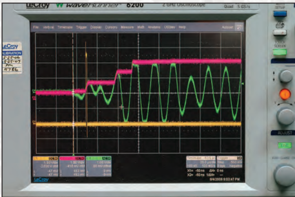
RF Output Waveform